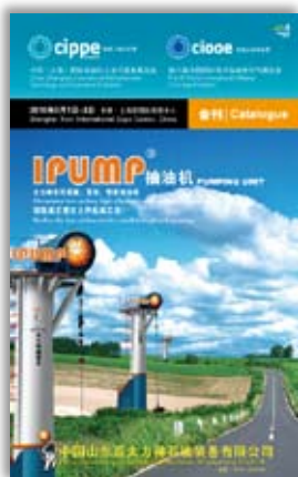
封面 Front Cover