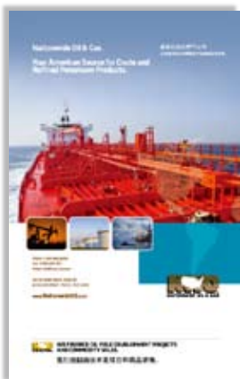
封底 Back Cover