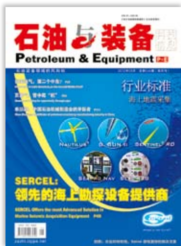
封面 Front Cover

Petroleum & Equipment (Official website: zazhi.cippe.net) is a professional comprehensive journal of petroleum equipment industry ("Database for Chinese Technical Periodicals" Periodical Full-text), The cippe promotional magazine specified. New technology, new arts & crafts, new products and new conceptions of the petroleum & equipment industry are reported in the magazine, which provides an information exchanging platform for petroleum equipment manufacturers and oil producing enterprises. It was published over 30,000 hits per two month, issued bimonthly for public distribution both at home and abroad, printed on full-color copper sextodecimo papers, with main target readers such as top managers, decision makers, technological and purchasing personnel of petroleum & equipment industry, covering oil fields, engineering companies, petrochemical companies, scientific research institutes and equipment manufacturing companies etc.. Chinese Standard Serial Number is CN 37-1021/N. The International Standard Serial Number is ISSN 1001-9960.