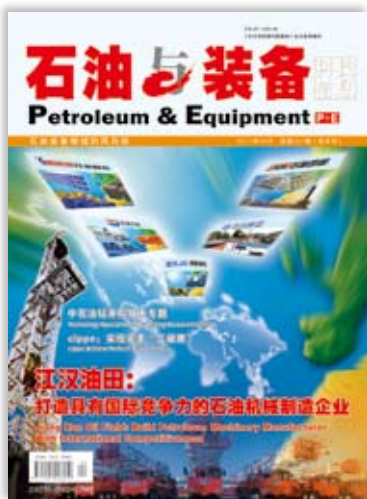
封面 Front Cover

Petroleum & Equipment (Official website: zazhi.cippe.net) is a professional comprehensive journal of petroleum equipment industry ("Database for Chinese Technical Periodicals" Periodical Full-text). New technology, new arts & crafts, new products and new conceptions of the petroleum & equipment industry are reported in the magazine, which provides an information exchanging platform for petroleum equipment manufacturers and oil producing enterprises. It was published over 30,000 hits per two month, issued bimonthly for public distribution both at home and abroad, printed on full-color copper sextodecimo papers, with main target readers such as top managers, decision makers, technological and purchasing personnel of petroleum & equipment industry, covering oil fields, engineering companies, petrochemical companies, scientific research institutes and equipment manufacturing companies etc.. Chinese Standard Serial Number is CN 37-1021/N. The International Standard Serial Number is ISSN 1990-5947.