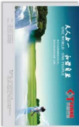
封底 Back Cover