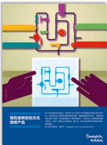
封底 Back Cover