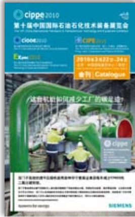
封面 Front Cover